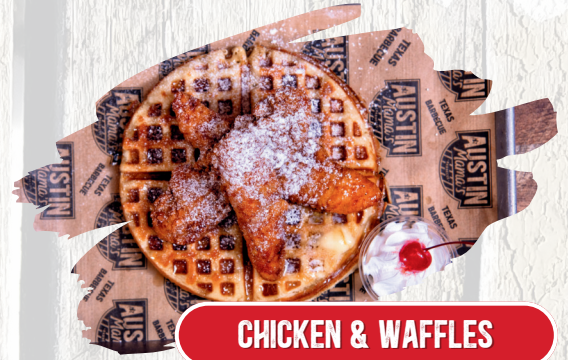
CHICKEN & WAFFLES

CHICKEN & WAFFLES V W/O CHICKEN Homemade Waffles with 3 Crispy chicken tenders , mapple syrup , wipped cream and cherry.