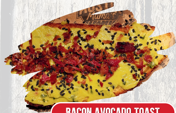
BACON AVOCADO TOAST

BACON AVOCADO TOAST V W/O BACON Crispy bacon, creamy avocado, and artisanal toast - a perfect trio. Topped with black sesame seeds .