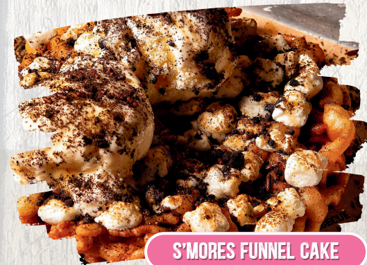
S'MORES FUNNEL CAKE