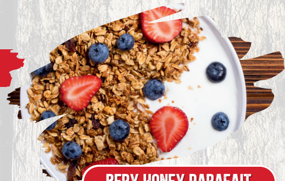
BERY HONEY PARFAIT

BERRY HONEY PARFAIT V a delightful blend of fresh mixed berries, creamy yogurt, and crunchy granola served with fruits.