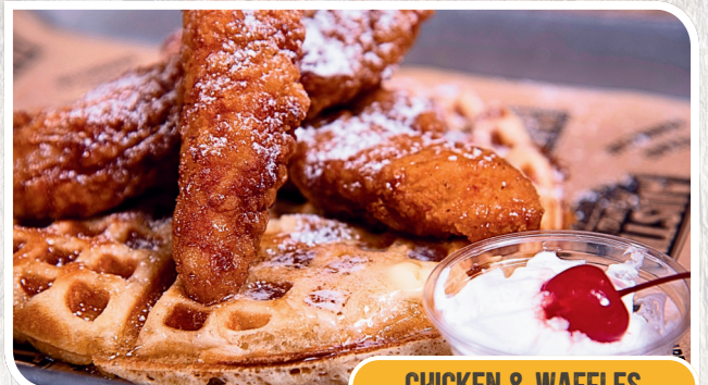
CHICKEN & WAFFLES

Recommended sides for kids - Curly fries or Mac and cheese