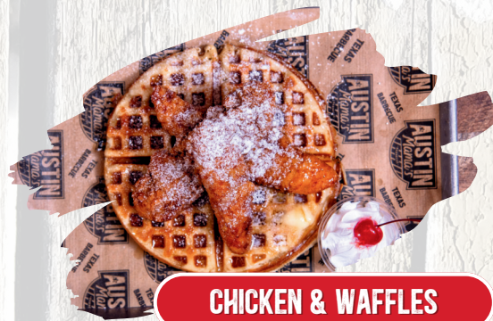
CHICKEN & WAFFLES