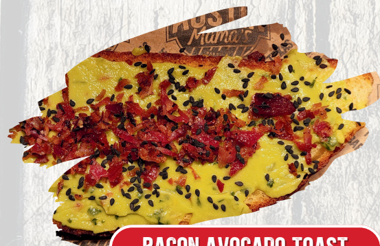
BACON AVOCADO TOAST