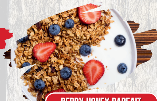
BERRY HONEY PARFAIT